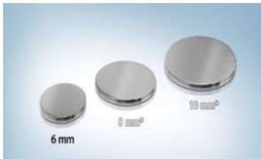
Figure 1 A commercially available disk source.